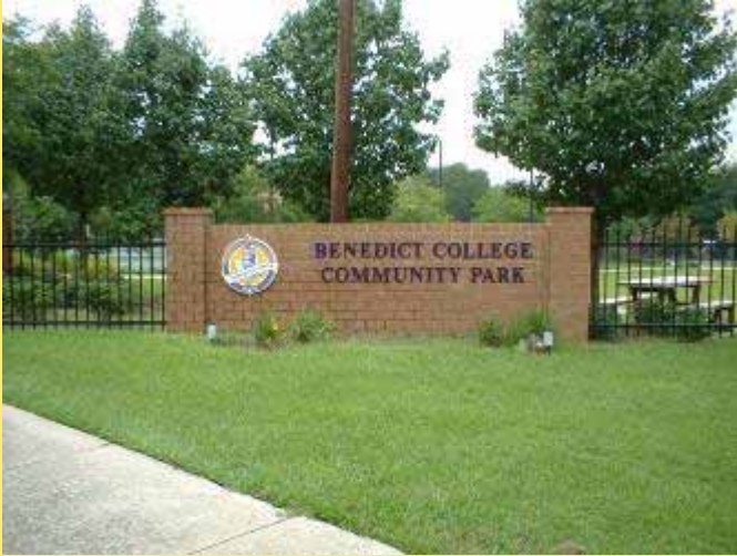
L-R Benedict College Community Park completed in 2004

The CDC serves as the outreach arm of the College initiating and managing various types of community development projects including affordable housing development, workforce development, economic development and the construction of community facilities.