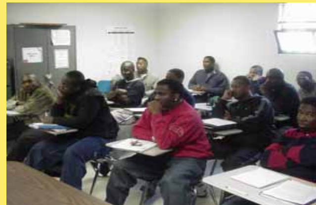
Individual Development Account (IDA) Program - Matched savings accounts for qualified participants - Financial literacy training