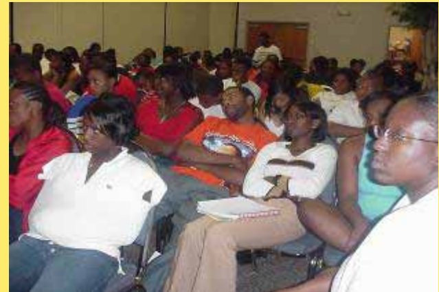
Freddie Mac CreditSmart Consumer credit education initiative