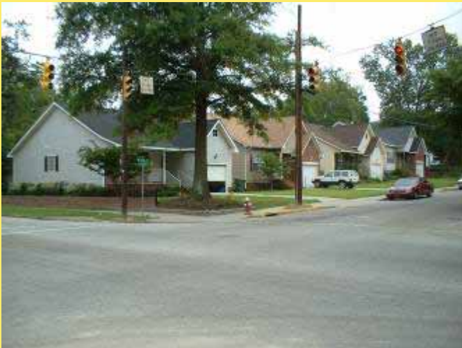
L-Oak Street Development 4 units. Cost $470,000 Completed 2002