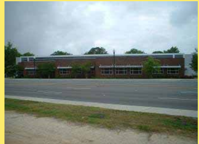
R-Benedict College Business Development Center 25,000 sq. ft. Cost 2.7 million dollars Completed 2002